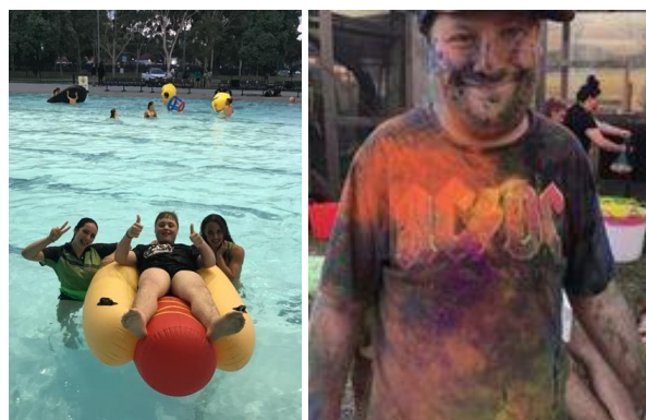
Getting wet and messy at Junior Carnival 2018

thank you to the organising committee, the volunteers, buddies, youth leaders and families who opened up their homes to help make Carnival such a memorable experience.