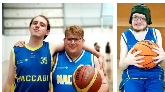
Basketball: always a firm favourite